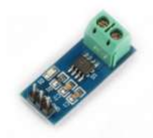
Fig 1.3: Current Sensor

proportional to that current. The generated signal can be an analog voltage or current or a digital output. The resulting signal can then be used to display the current measured in an ammeter, or can be stored in a data acquisition system for further analysis, or can be used for control purposes.