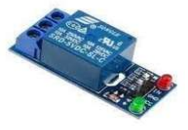
Fig 1.2: Relay

Coil carries a relatively high current, typically 30mA for a 12V relay, but it can be as high as 100mA for relays designed to operate at lower voltages. Most integrated circuits (chips) cannot supply this current, and transistors are usually used to amplify the small current from the IC to the higher value required by the relay coil. The popular 555 timer IC has a maximum output current of 200mA, so these devices can directly drive relay coils without amplification.